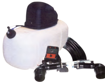
2. # MS-901801