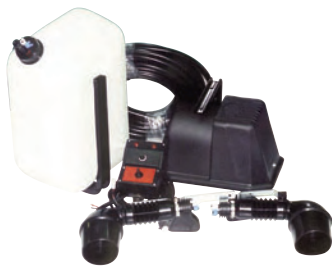
1. # MS-901654